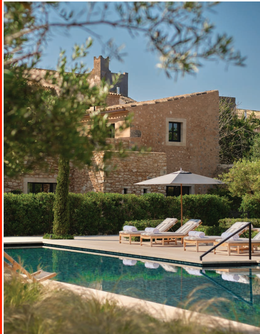
HOTEL CAN FERRERETA, MALLORCA