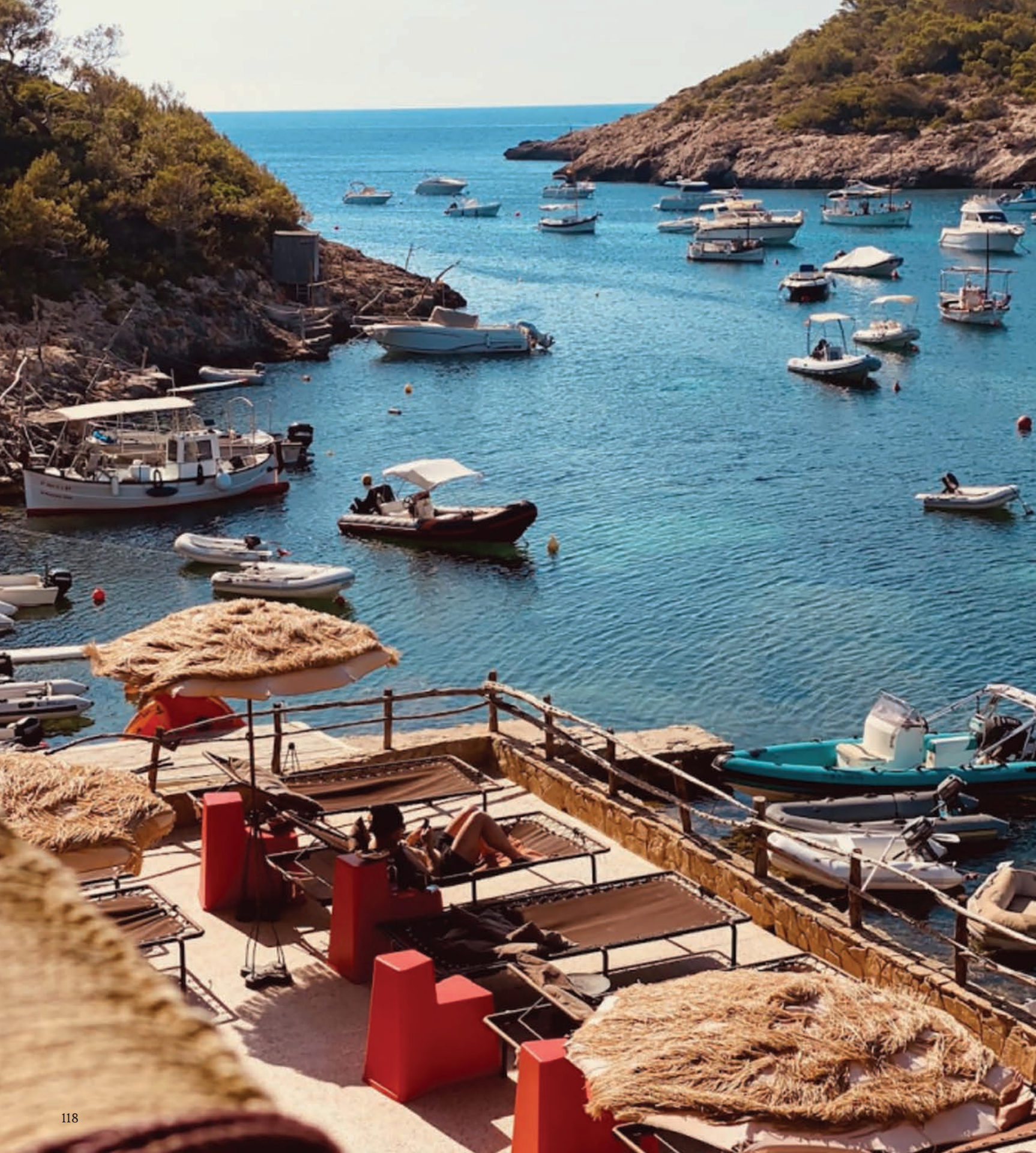
HOTEL LOS ENAMORADOS, IBIZA