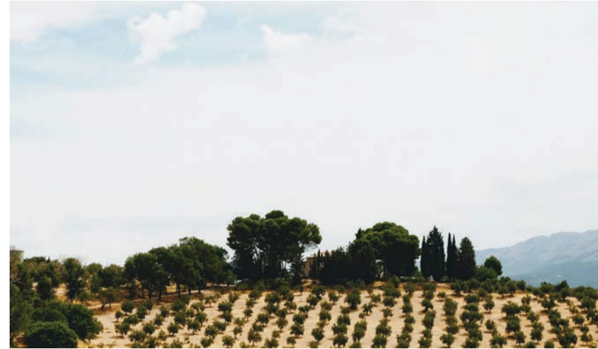
CORTIJO DEL MARQUÉS, ANDALUCÍA