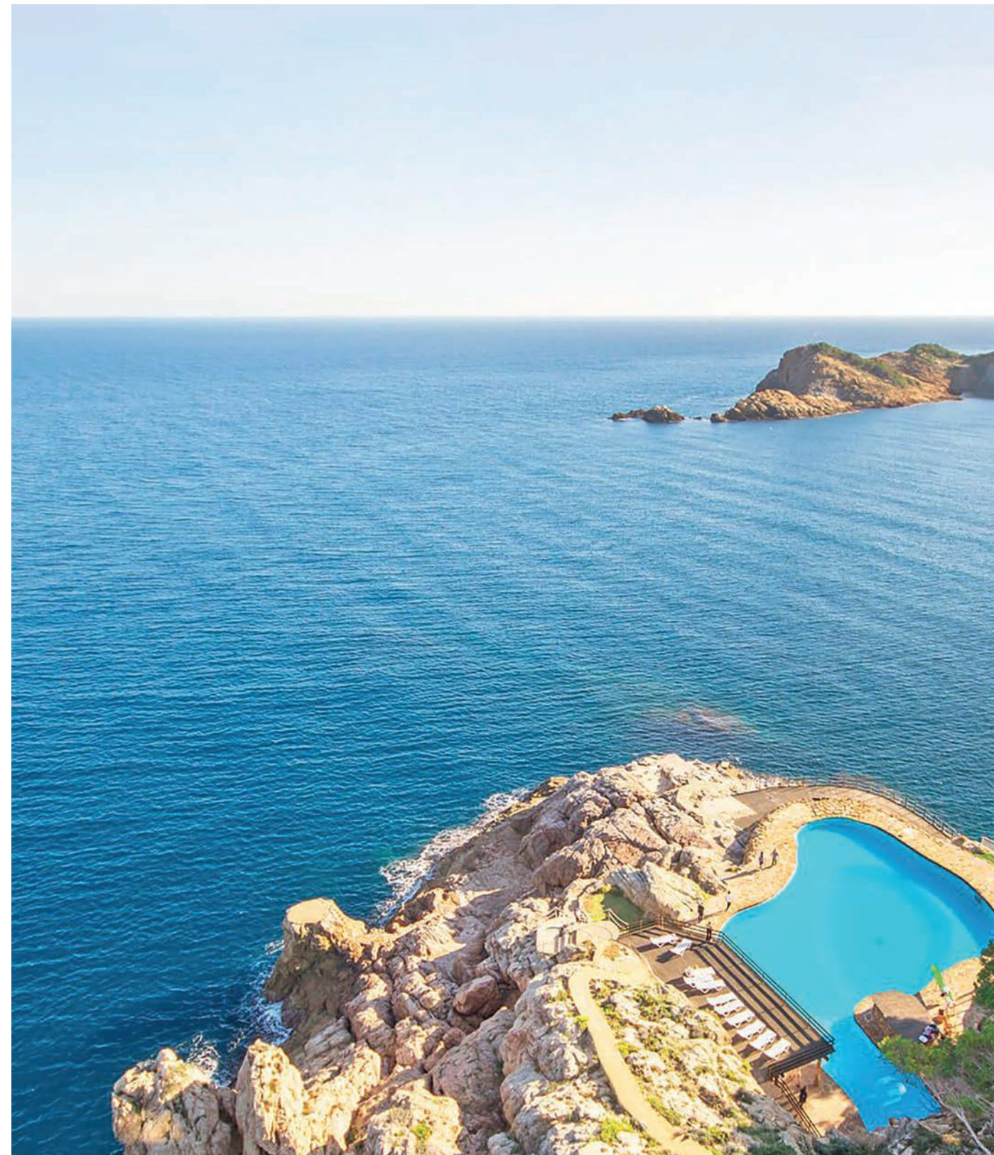
CAP SA SAL, CATALONIA

PREVIOUS SPREAD: SANT FRANCESC HOTEL SINGULAR, MALLORCA