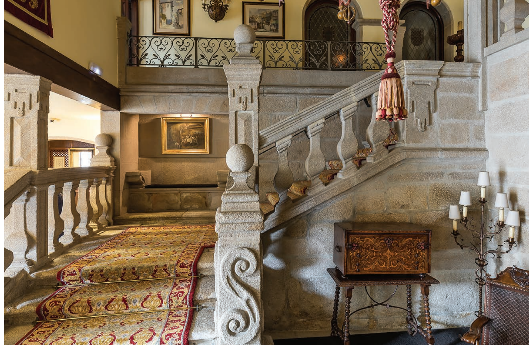
PARADOR DE PONTEVEDRA, GALICIA