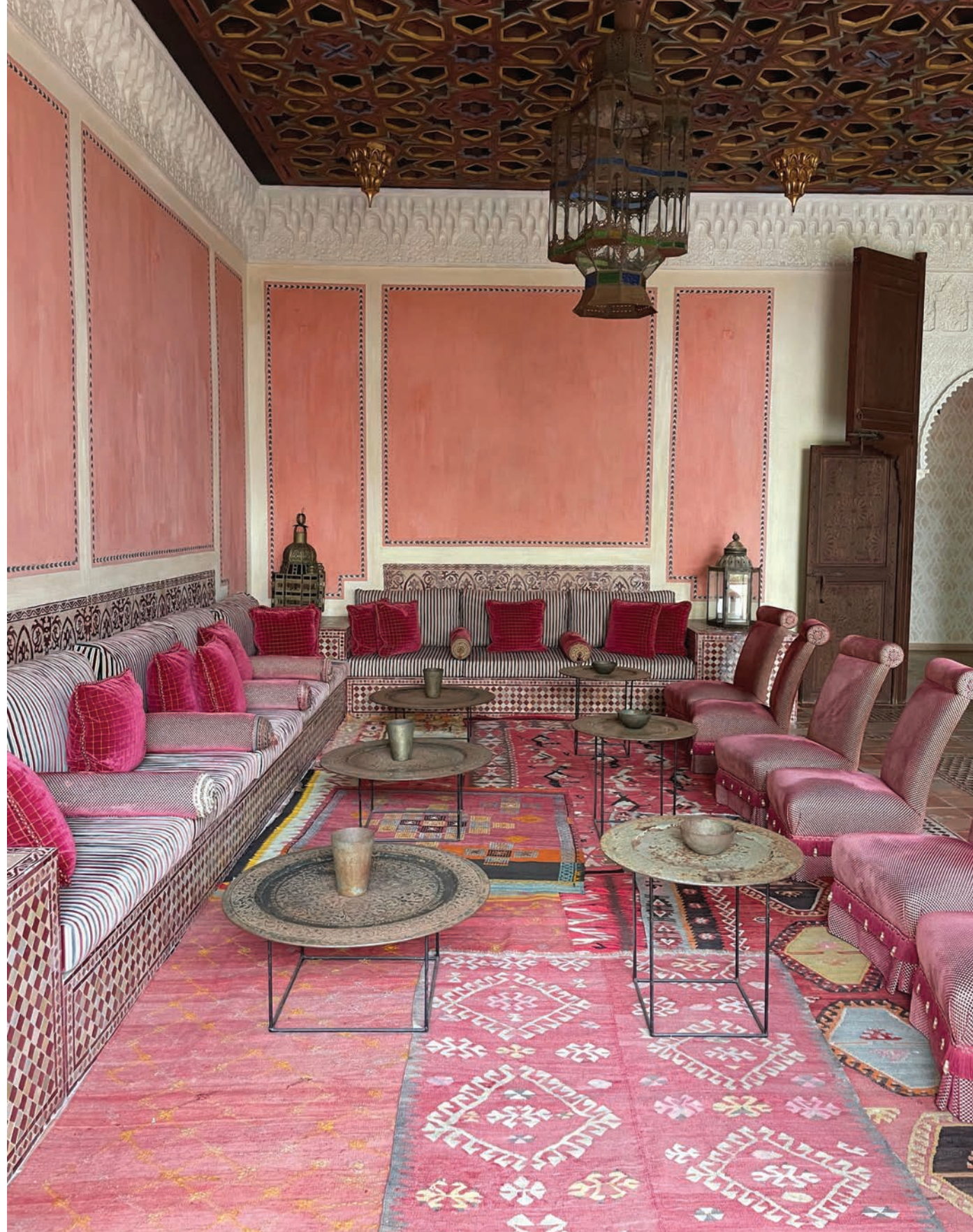
FINCA CORTESIN, ANDALUCÍA