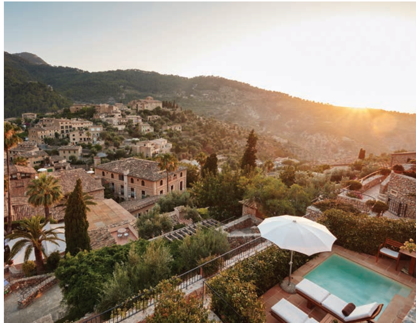
LA RESIDENCIA, MALLORCA