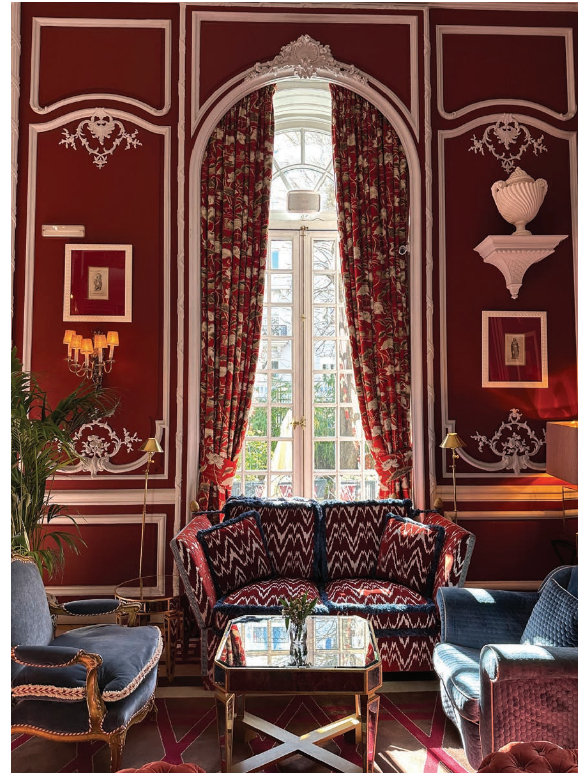
SANTO MAURO, MADRID