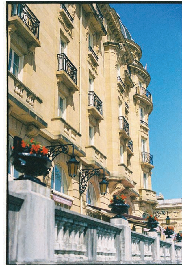
HOTEL MARIA CRISTINA, BASQUE COUNTRY