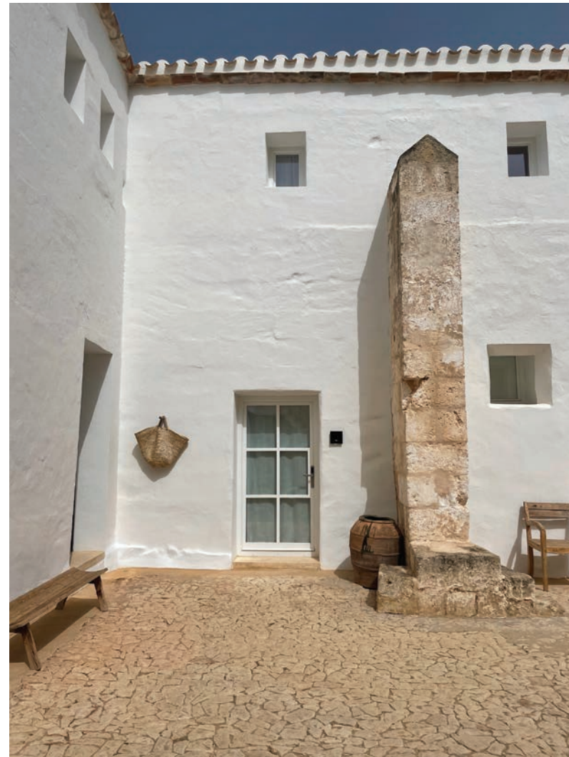
TORRE VELLA FONTENILLE, MENORCA