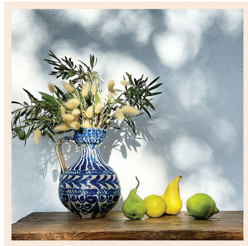
FINCA LA DONAIRA, MÁLAGA