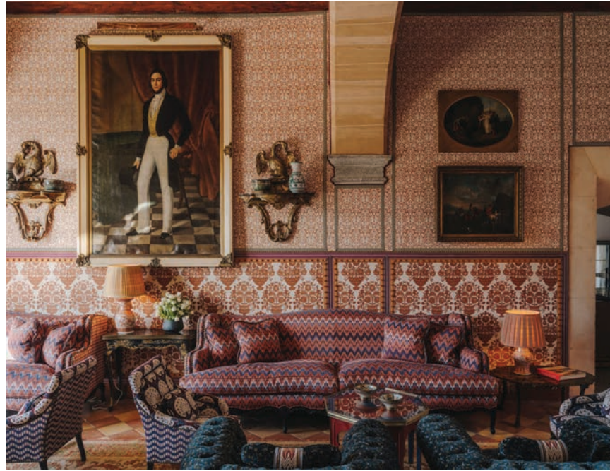
GRAND HOTEL SON NET, MALLORCA