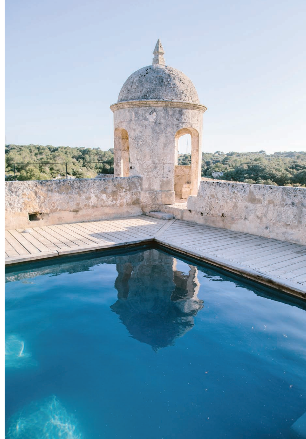
FONTENILLE MALLORCA SANTA PONSA, MENORCA