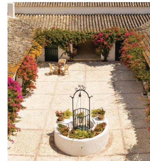
HACIENDA DE SAN RAFAEL, ANDALUCIA